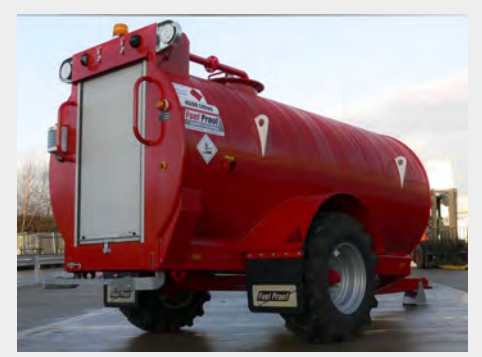
4,500 LITRE SITE TOW DIESEL BOWSER