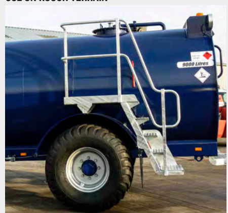
LARGE FLOTATION TYRES FOR OFF-ROAD USE, PLUS GALVANISED REFUELLING PLATFORM (6000 & 9000L)