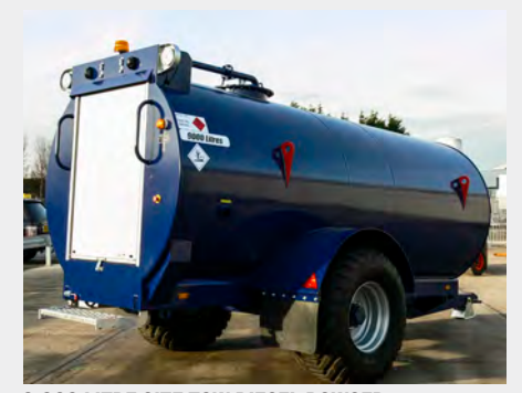
9.000 LITRE SITE TOW DIESEL BOWSER