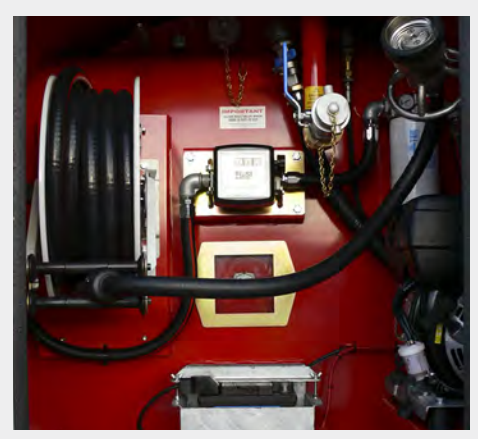
FULL-HEIGHT CABINET ON ALL MODELS ALLOWS FOR EASY ACCESS TO FUEL DISPENSING EQUIPMENT