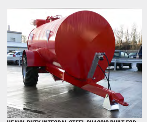
HEAVY-DUTY INTEGRAL STEEL CHASSIS BUILT FOR USE ON ROUGH TERRAIN