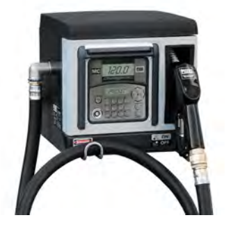
PIUSI FUEL MANAGEMENT SYSTEM