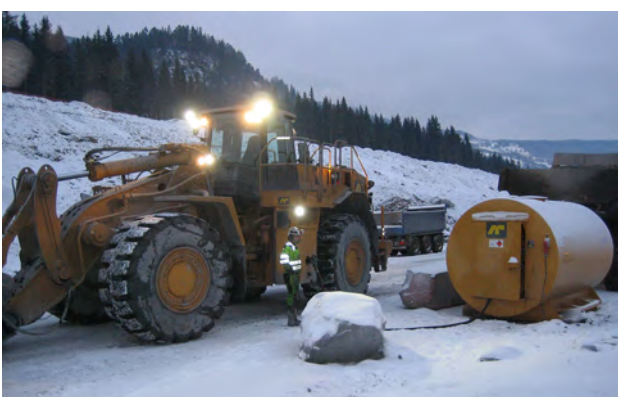
HEAVY-DUTY STEEL CONSTRUCTION PROVIDES OUTSTANDING DURABILITY AND RELIABILITY EVEN IN THE HARSHEST CONDITIONS