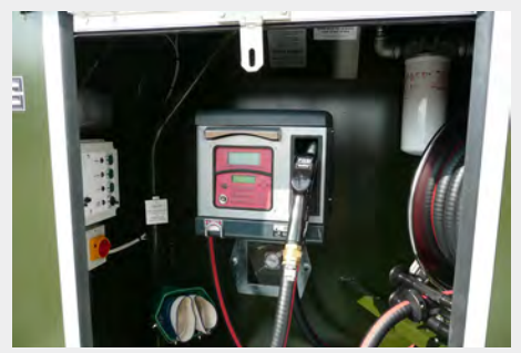
AVAILABLE WITH A WIDE RANGE OF DISPENSING EQUIPMENT INCLUDING FUEL MANAGEMENT AND COMBINED ALARM SYSTEMS