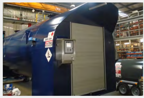
ROLLER SHUTTER DOOR OPTION ALSO AVAILABLE