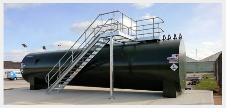
HORIZONTAL BULK DIESEL TANK WITH GALVANISED ACCESS PLATFORM