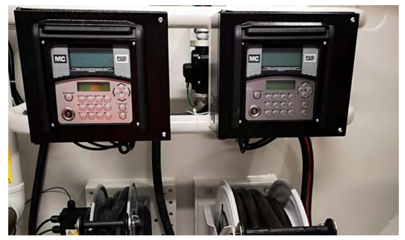
TWIN PIUSI FUEL MANAGEMENT SYSTEM INSTALLED IN BULK DIESEL TANK