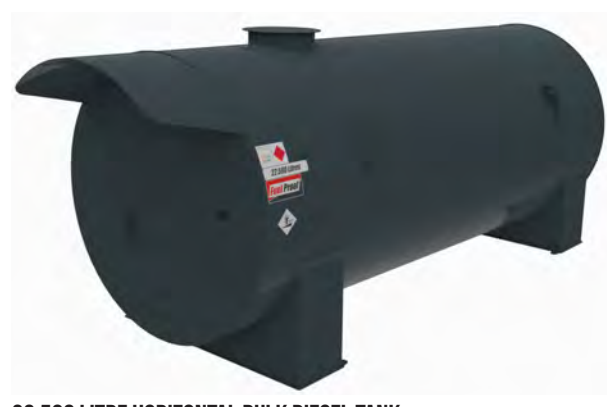
22,500 LITRE HORIZONTAL BULK DIESEL TANK