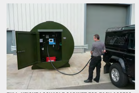
FULL-HEIGHT LOCKABLE CABINET FOR EASY ACCESS TO DISPENSING EQUIPMENT AND TANK CONNECTIONS