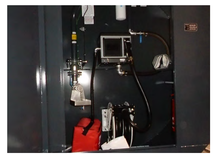
PIUSI FUEL MANAGEMENT SYSTEM INSTALLED IN BULK DIESEL TANK