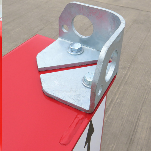
FORKLIFT POCKETS AND GALVANIZED LIFTING EYES FOR EASY STACKING AND EFFICIENT TRANSPORT