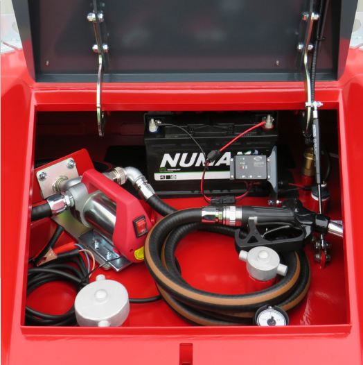
STANDARD TANK CONNECTIONS, ROTARY FUEL GAUGE AND OPTIONAL PARTICLE FILTER WITH DIGITAL FLOW METER