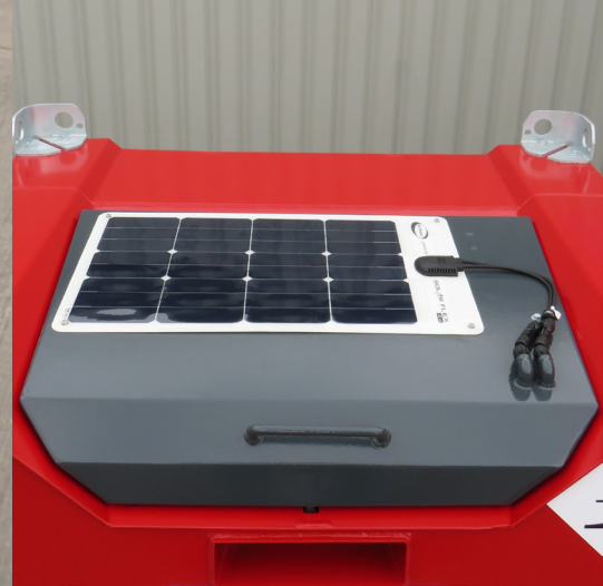
LOCKABLE LID WITH SOLAR PANEL, INTERNAL HINGES AND GAS STRUT ASSISTED OPENING FOR EASE OF USE